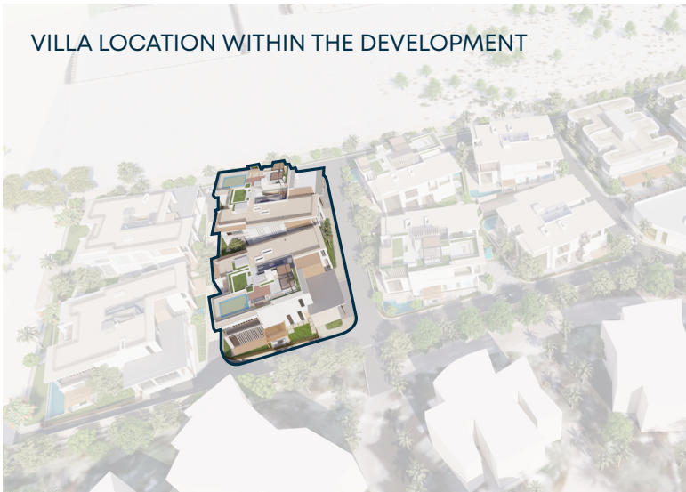
VILLA LOCATION WITHIN THE DEVELOPMENT

A barbecue and service counter for rooftop entertaining.