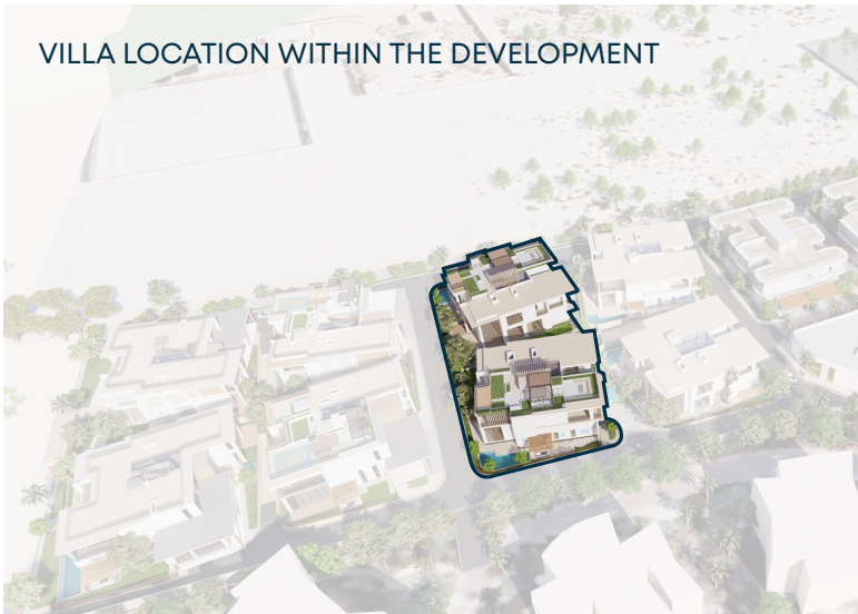
VILLA LOCATION WITHIN THE DEVELOPMENT

View deck with comfortable seating, perfect for taking in the breath-taking views.