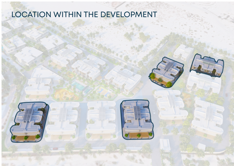
LOCATION WITHIN THE DEVELOPMENT